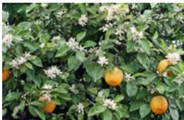
Fig. 1. Citrus aurantium L.

Citrus aurantium L. (Rutaceae) is a tree with a height of 3-5 m with round crown flower that has seen in northern and southern area of Iran (Figure 1).