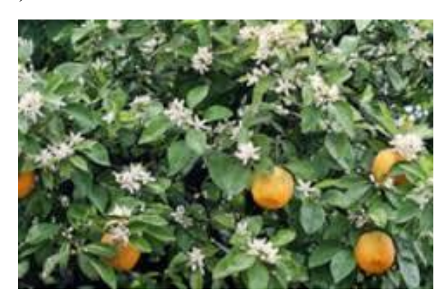
Fig. 1. Citrus aurantium L.

Citrus aurantium L. (Rutaceae) is a tree with a height of 3-5 m with round crown flower that has seen in northern and southern area of Iran (Figure 1).